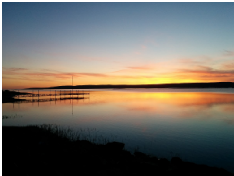
“Big Pond, Nova Scotia” by Capercanuck is licensed under Creative Commons Attribution-Share Alike 4.0 International license