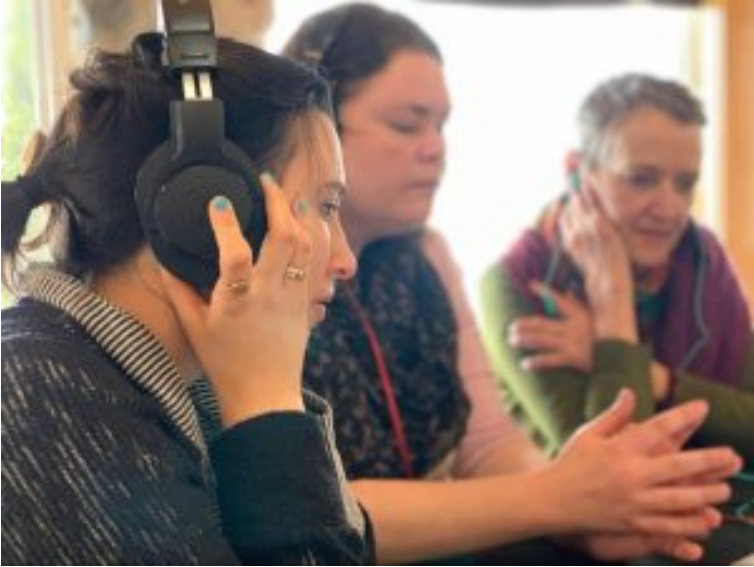
Participants at an in-person transcription frolic.